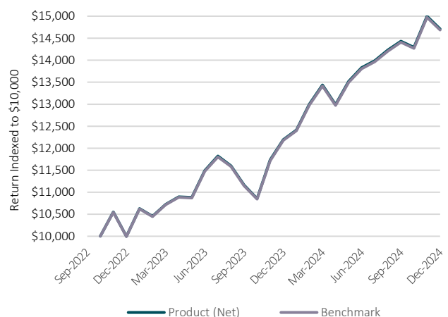
Cumulative monthly returns net of fees Unit class A 31 October 2022 to 31 December 2024